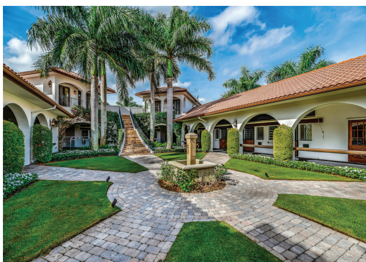
GRAND PRIX FARMS | $7,950,000

5.5 Bathrooms | Saltwater Pool | Exclusive Gated Community | Gourmet Chef's Lounge with Kitchen and Bathroom | 2 Staff Apartments | Grooms' Lounge with Kitchen | Impact Glass and Generator | European White Oak Floors | Guest Kitchen | Outdoor Patio with Summer Kitchen Overlooking the Ring | Adjacent