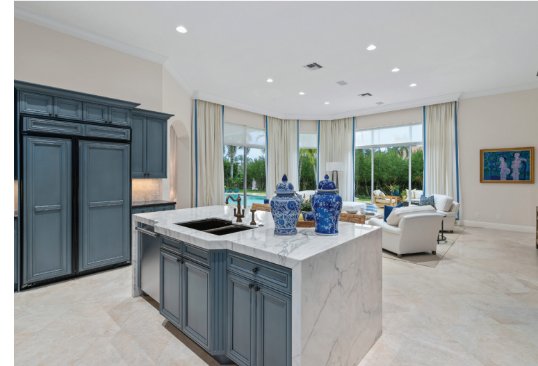
PALM BEACH POLO | MIZNER ESTATE | $2,450,000

RWB Construction Collaboration | Construction Completed May 2019 | 11,654 Square Feet with 5 Bedrooms | 114 Feet of Water Frontage | Rare Marbles | Perfect for Entertaining | Light-Filled with Huge Windows | Chef's Kitchen | Gas Imported from the Hills of Italy | Gorgeous Walnut Cabinetry Sourced from Cooking | Waterfall Island | Billiard Room | Fireplace | 2-Bay Garage | New Marble Canada | Custom Furniture with an Exclusive Touch