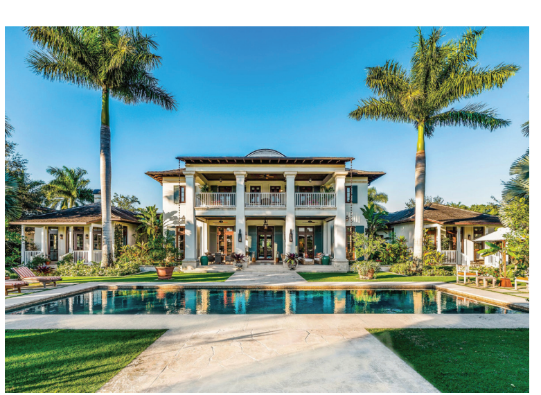
RANCH COLONY | JUPITER | $7,995,000

Master with Fireplace and Marble Bathroom | 6-Burner Wolf Gas Range | Fully Equipped Gym | Impact Glass | Elevator | 3-Bedroom Grooms' Quarters | All-Weather Arena | Grand Prix Field | Renovated in 2015 | Two 1-Bedroom Guest