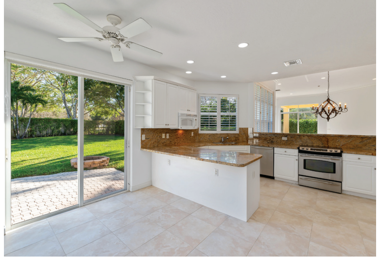
PALM BEACH POLO | EAGLES LANDING | $565,000

3-Bedroom, 3.5-Bathroom Pool Home | Immaculate Renovation | Impact Glass 3-Bedroom, 3.5-Bathroom Light-Filled Home | Open Concept | One-Story Floor and Accordion Shutters | New Hardwood Floors | Waterfall Granite Island | Outdoor Living Area