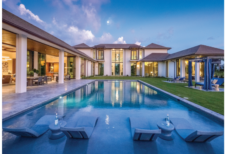
"EL SUENO" | CYPRESS ISLAND | $10,495,000

RWB Construction Collaboration | Construction Completed May 2019 | 11,654 Square Feet with 5 Bedrooms | 114 Feet of Water Frontage | Rare Marbles | Perfect for Entertaining | Light-Filled with Huge Windows | Chef's Kitchen | Gas Imported from the Hills of Italy | Gorgeous Walnut Cabinetry Sourced from Cooking | Waterfall Island | Billiard Room | Fireplace | 2-Bay Garage | New Marble Canada | Custom Furniture with an Exclusive Touch